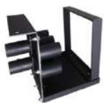
Distributor for suction probes