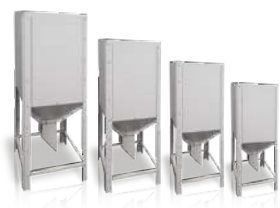
Metal folding pellet store