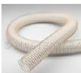
Transport hose DN50 / 10m