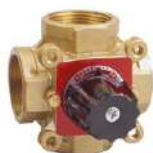
4-way mixing valve