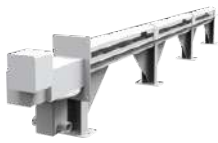
Screw auger for self-assembly equipped with a suction probe for use with a pneumatic transport system (VACUUM).