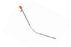
Pellet auger with a flexible element and mass sensor.