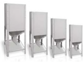
Metal folding pellet store