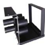
Distributor for suction probes