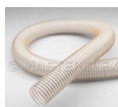
Transport hose DN50 / 10m