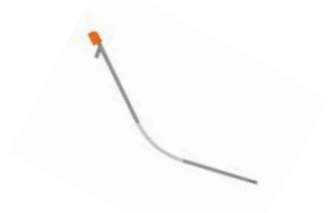
Pellet auger with a flexible element and mass sensor.