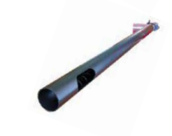
Pellet auger with mass sensor.