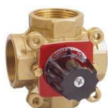
4-way mixing valve