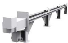
Screw auger for self-assembly equipped with a suction probe for use with a pneumatic transport system (VACUUM)